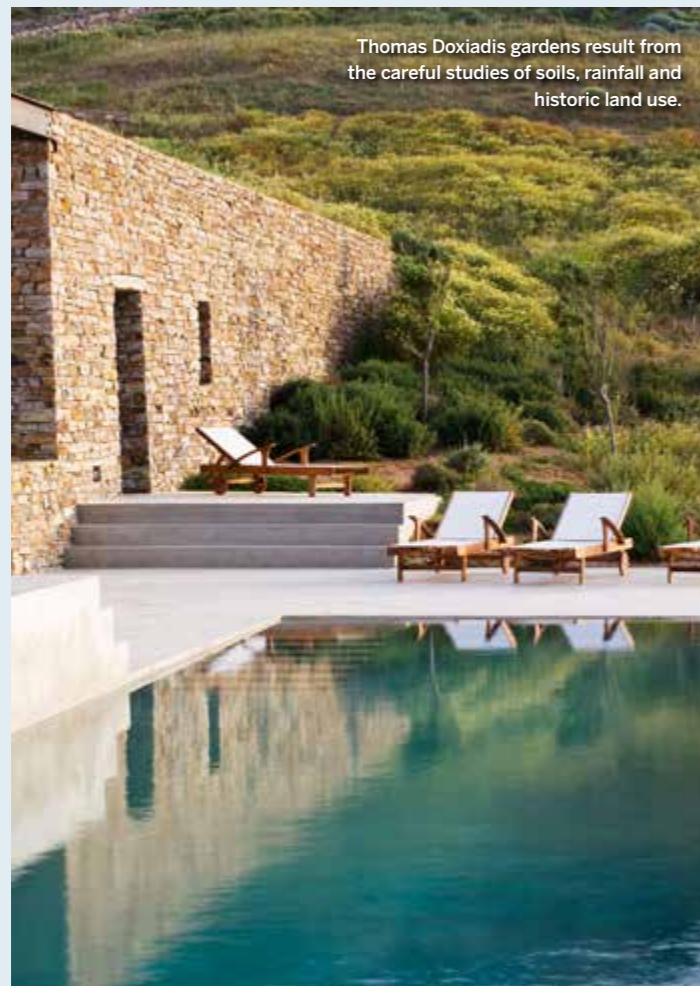
Thomas Doxiadis gardens result from the careful studies of soils, rainfall and historic land use.