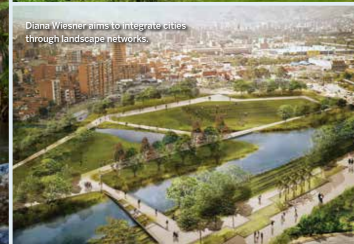
Diana Wiesner aims to integrate cities through landscape networks.