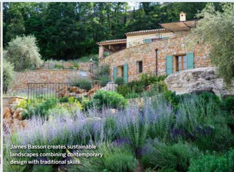
James Basson creates sustainable landscapes combining contemporary design with traditional skills.