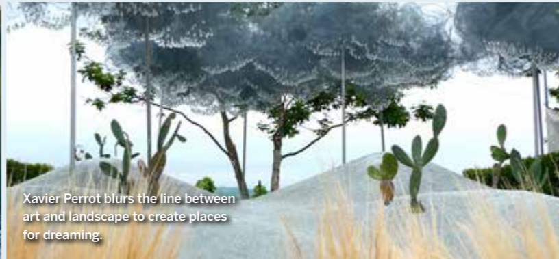
Xavier Perrot blurs the line between art and landscape to create places for dreaming.